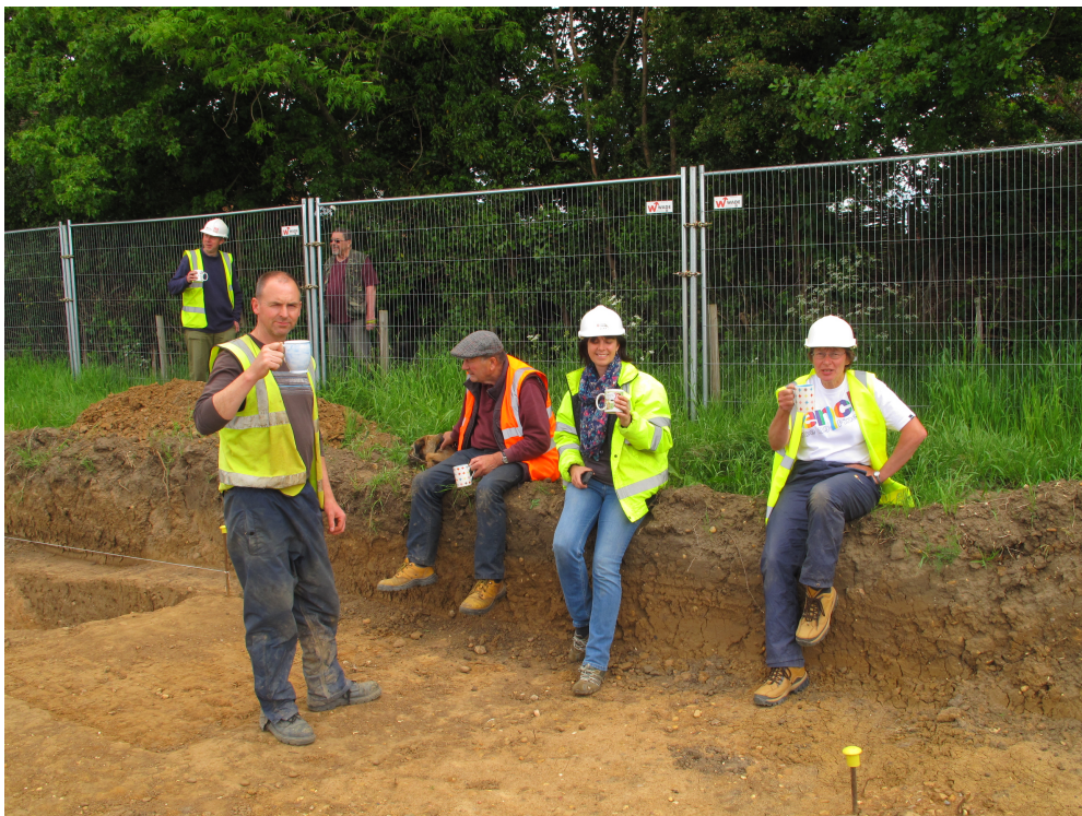
Time for a well earned rest and a cuppa