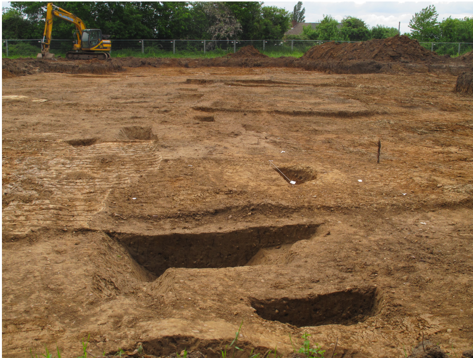
The site – looking West

To whet your appetite here are a couple of photographs I took at the time.